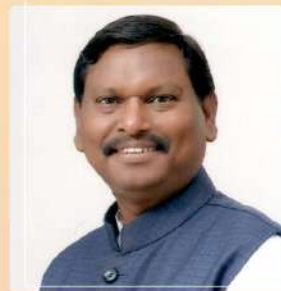
Shri Arjun Munda Hon'ble Minister of Tribal Affairs