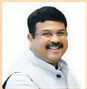
Shri Dharmendra Pradhan Hon'ble Education Minister