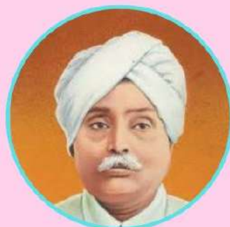
Lala Lajpat Rai (1865 – 1928) Who founded and Nurture the great movement