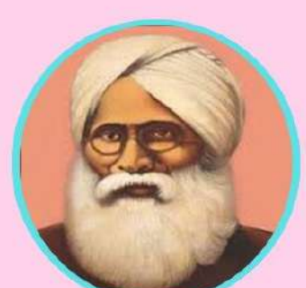
Mahatma Hansraj (1864 – 1938) First Principal of the First DAV College at Lahore