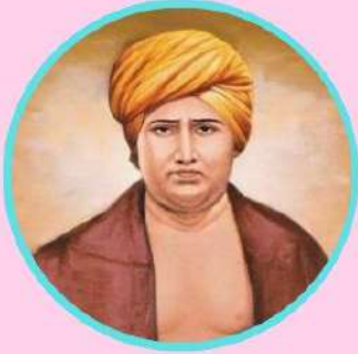
Swami Dayanand Saraswati (1824 – 1883) Founder Of Arya Samaj