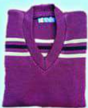
Sweater Prep. to Class II