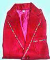
Blazer Class III onwards