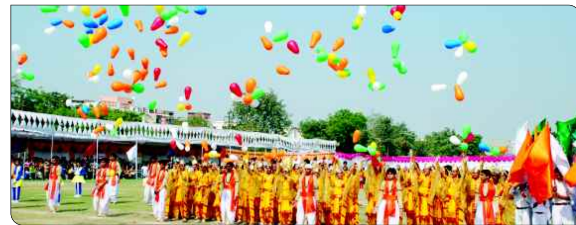
Opening ceremony of the Tournament