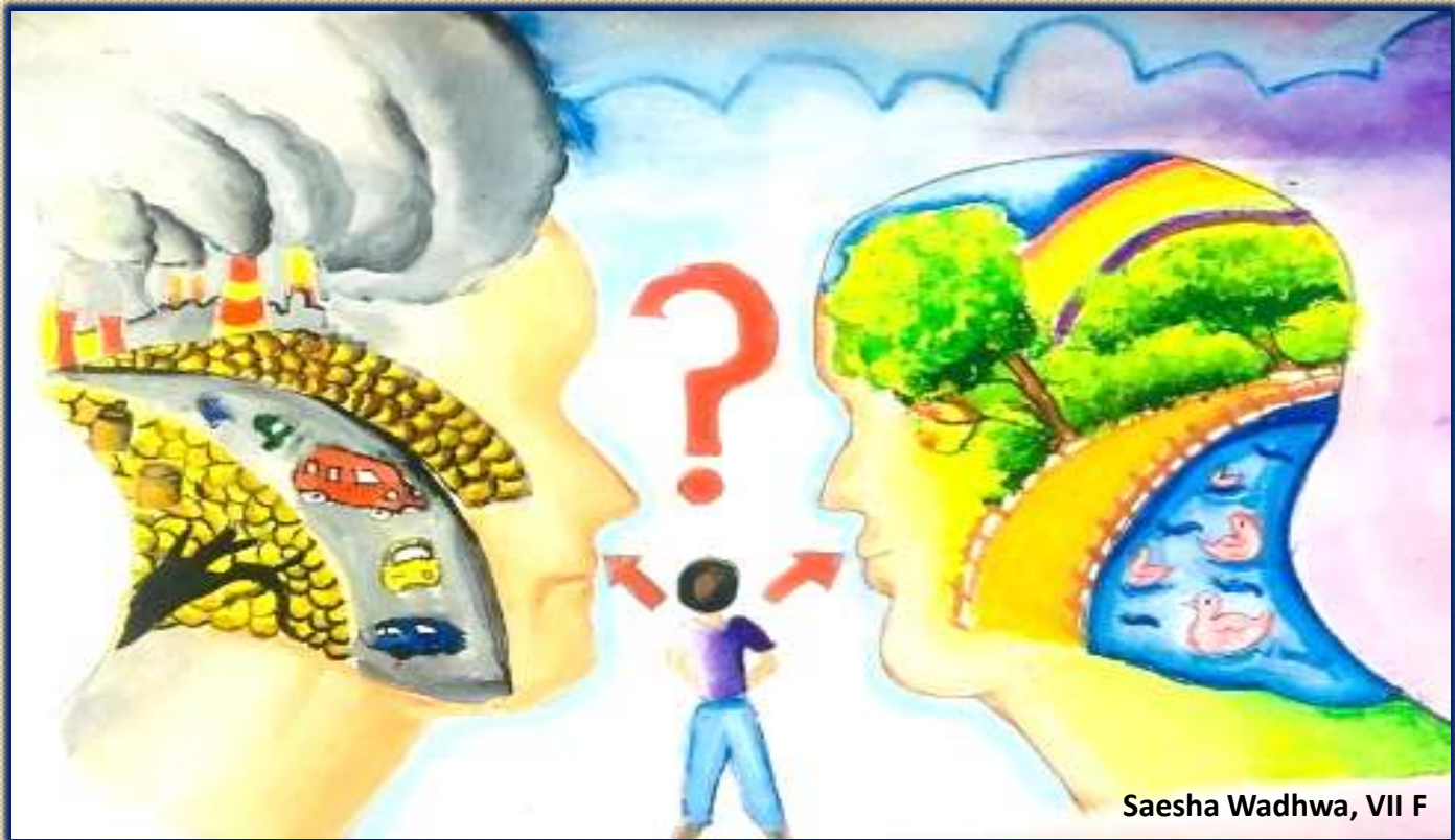
Saesha Wadhwa, VII F