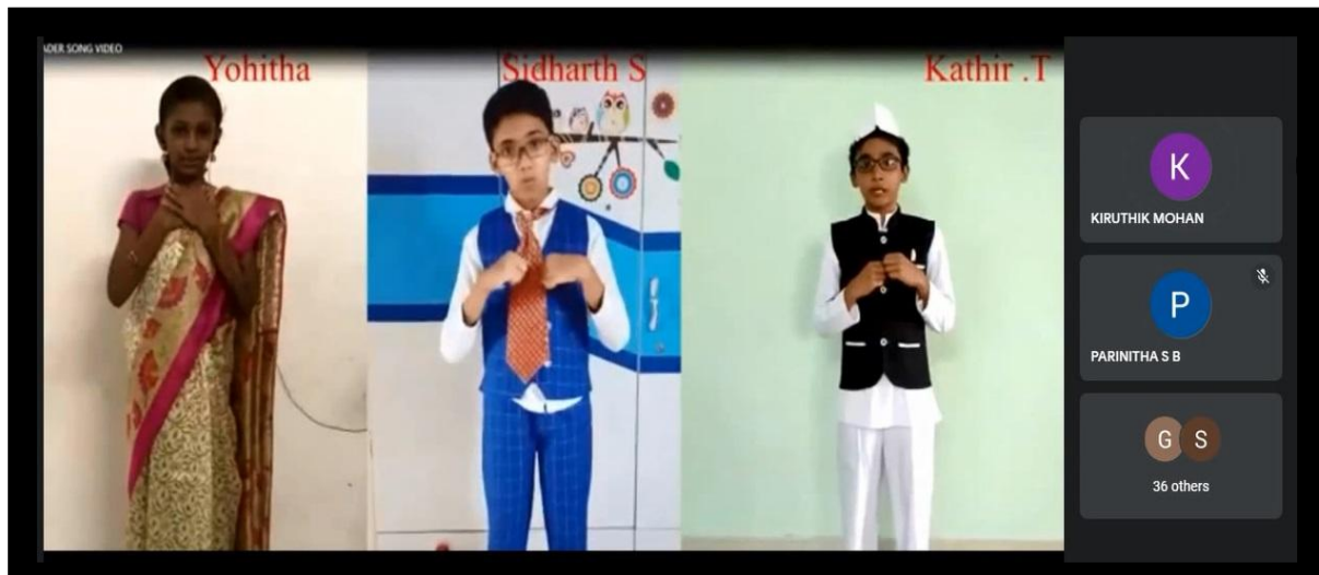
An Action Song Titled “A Leader A Leader”