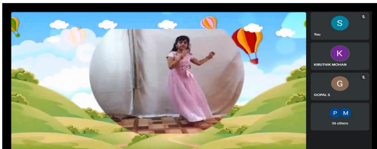
“Aao Hum Sab Haath Milayien”