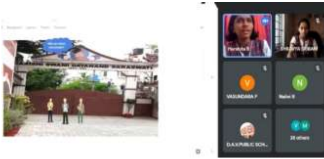
The pigeon and its caretaker cruise all the bright places of the school!