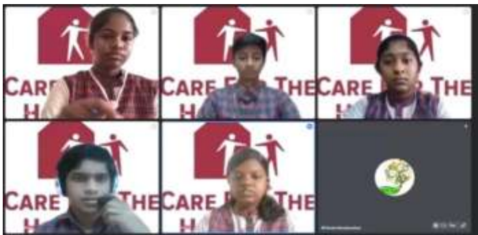
Students pitch in to render various community services through SEWA projects committing to the patriotic words of the Indian pledge