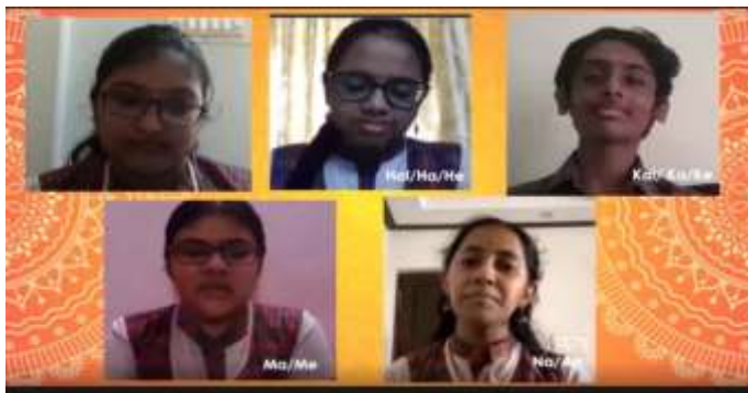
The students play a cadenced game of 'Antakshari', yodelling heavenly patriotic songs