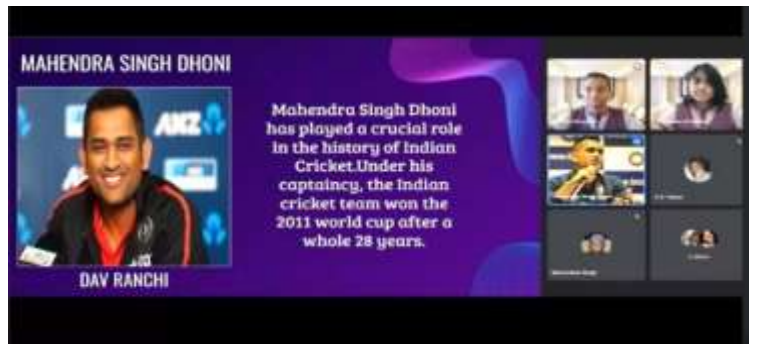
Well - renowned DAV Alumni, sit together for a meet and greet with our school hosts to dish on how our institution induced patriotism in them to work for our nation!