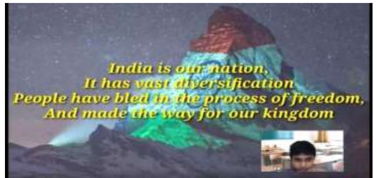
Activities given by teachers to resonate patriotism through poetry and dohas entice patriotism among students!