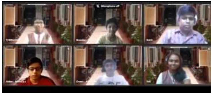
Exchange Students traverse the patriotic dimensions of D.A.V. with the help of its representatives