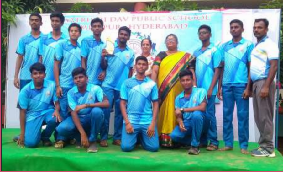
WINNERS - KABADDI