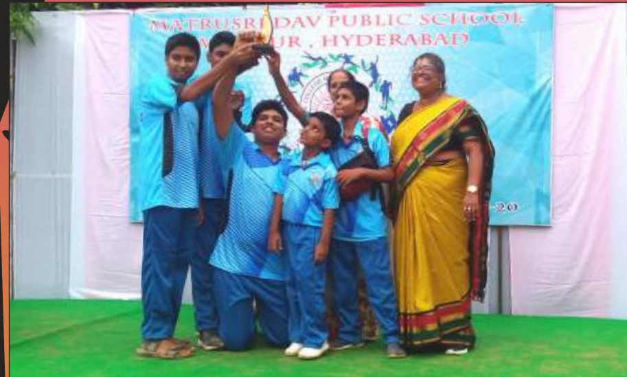
RUNNER UP - CHESS