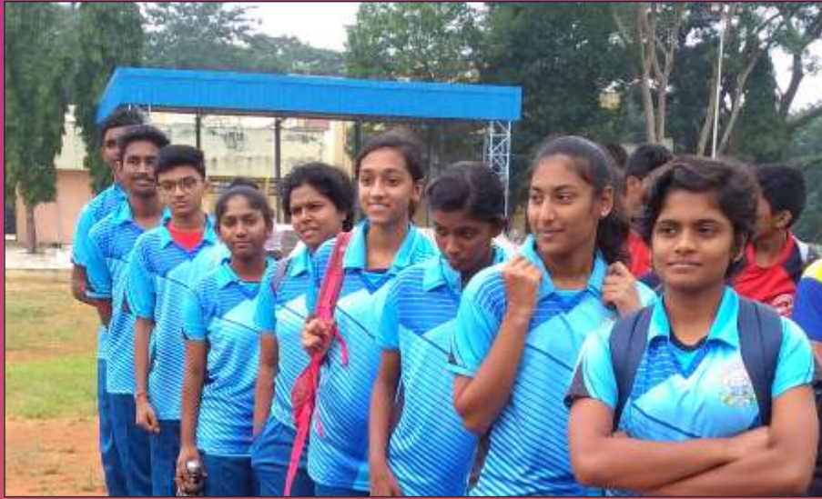
GETTING READY FOR EVENTS