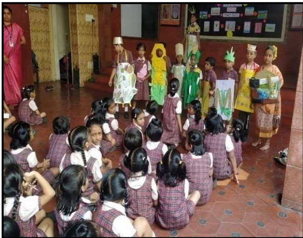
Exploring Nature's Wardrobe: A Millet Extravaganza

In commemoration of International Year of Millets, our School organised a fancy dress event where the students of classes I and II were encouraged to dress up as any millet of their choice. Students demonstrated their commitment to promoting awareness about millets in a visually appealing manner. The students expressed confidence and creativity in their theme based millet costumes, making the event not only entertaining but also educational. The event succeeded in fostering a sense of appreciation among the audience for these nutritious grains, leaving a lasting impact on both participants and spectators.