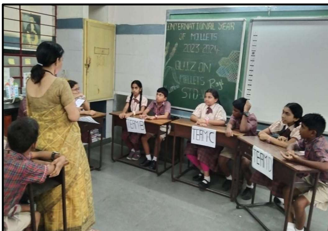
Students of Std. VI 'Mindscape Rumble'