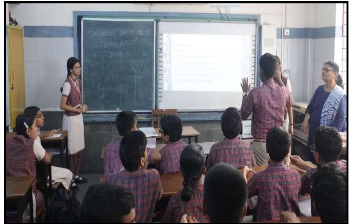
Avid Quizzers in Action