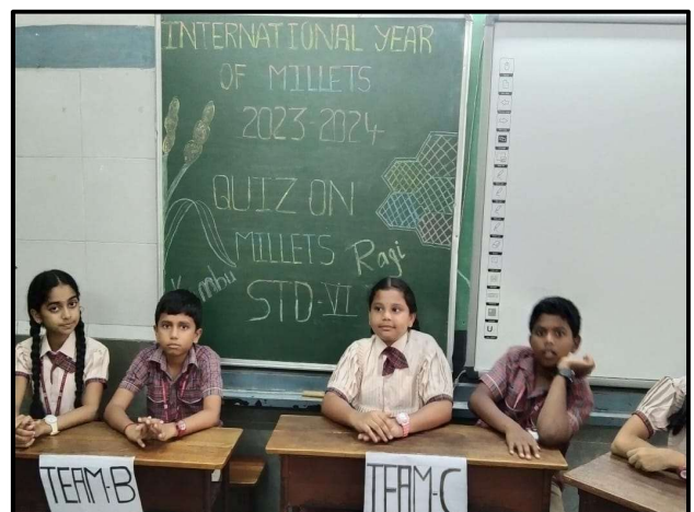
Whiz Wizard Showdown