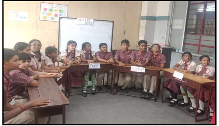
Students of Std. VII Compete to ace the Quiz Competition