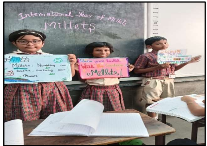
Poster making – “Discover the Power of Millets” by students Std. V