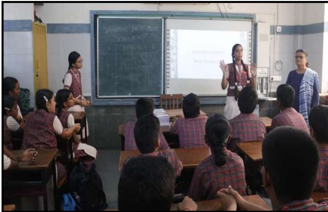
Quiz Mater Explaining the Rules