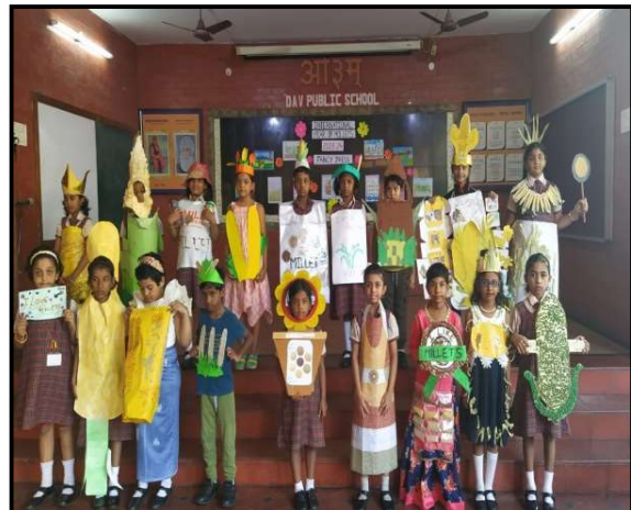
Dressed in Millets : Sprouting seeds of creativity