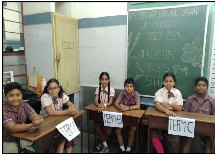
Brain Blast Challenge