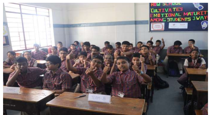
The Final Scores And The Jubilant Winners of Std. VIII