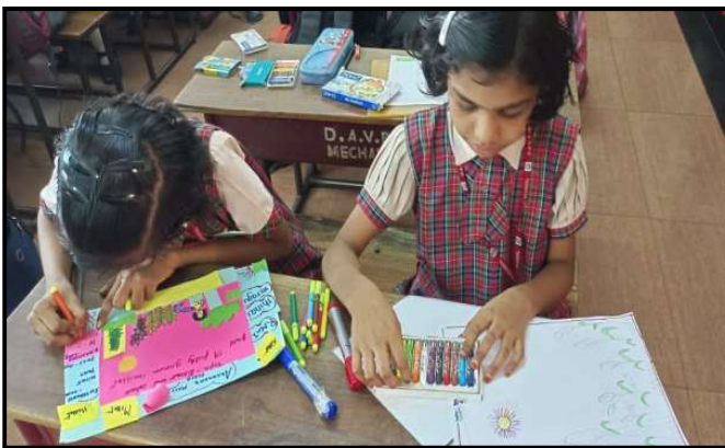
Students transforming millet field into a masterpiece

This hands-on experience provided a unique opportunity for students to learn about the importance of millet cultivation and its role in ensuring food security. It helped foster an understanding of the significance of traditional crops in our diverse agriculture. Overall, it was an enriching and educational experience that allowed young artists to explore the beauty of the millet fields through their artistic lenses.