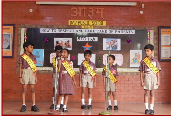
Role of Parents Goes Beyond Words