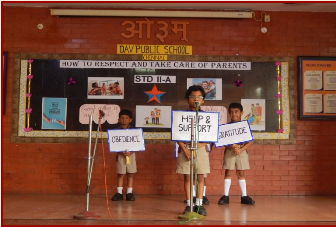
Caring for Parents' is the Purest Form of Gratitude