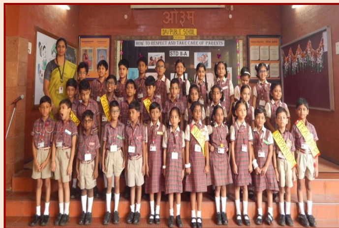
When We Move as One, We Shine Even Brighter