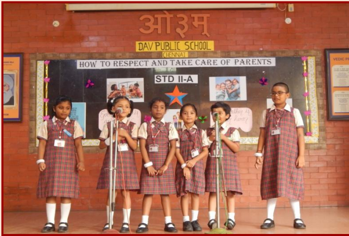
A Melody from Our Heart