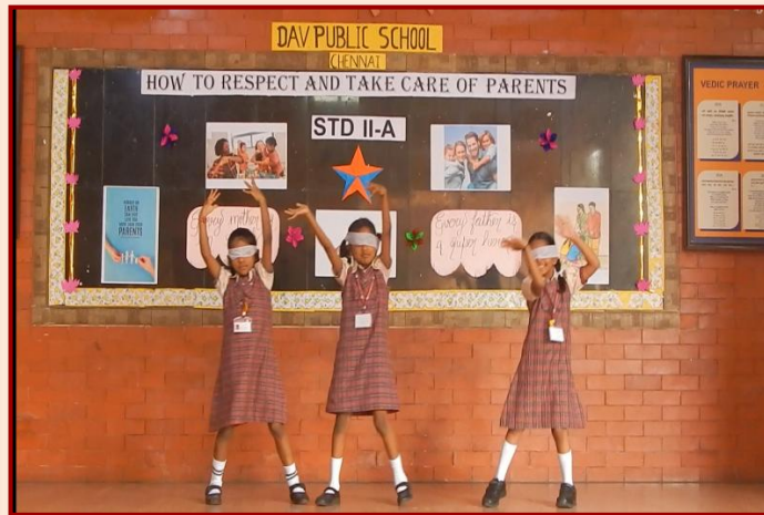
Dancing Blindfolded, Guided by the Love of Parents