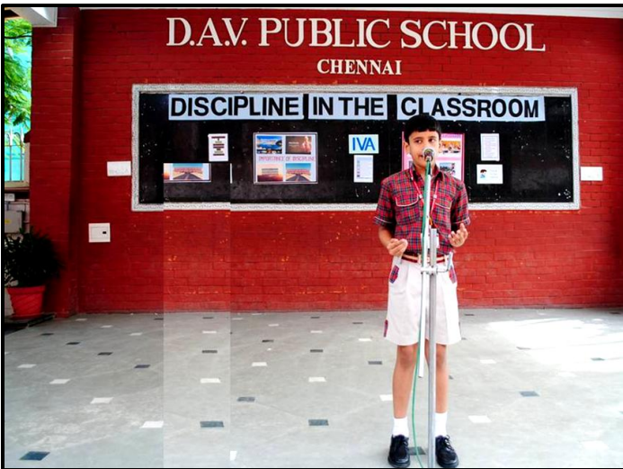
A Speech on Importance of disciplined behaviour