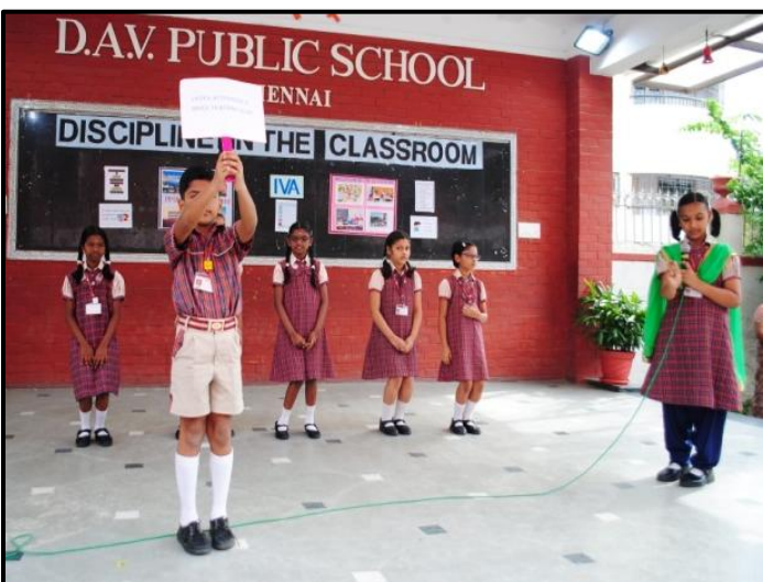
Teacher's Role in disciplined behaviour