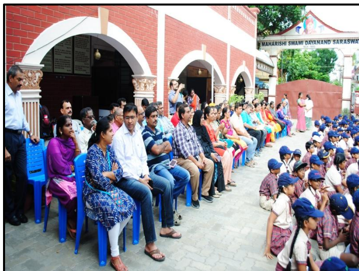
Parents enjoying the morning assembly