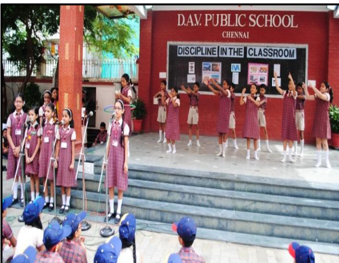
Dance – 'Follow the rules and have fun!'