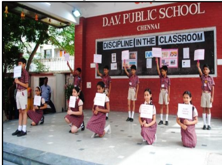
A Scene depicting 5 ways of being Disciplined in the Classroom