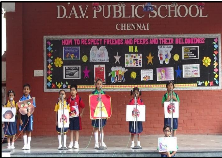
Speech – How to Respect Friends and Peers

TOPIC : HOW TO RESPECT FRIENDS AND PEERS AND THEIR BELONGINGS – 5 WAYS