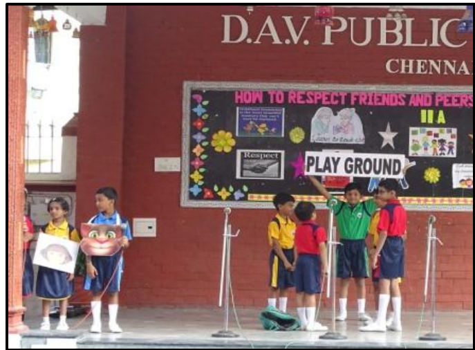
Role Play on "Respect – Need of the hour"