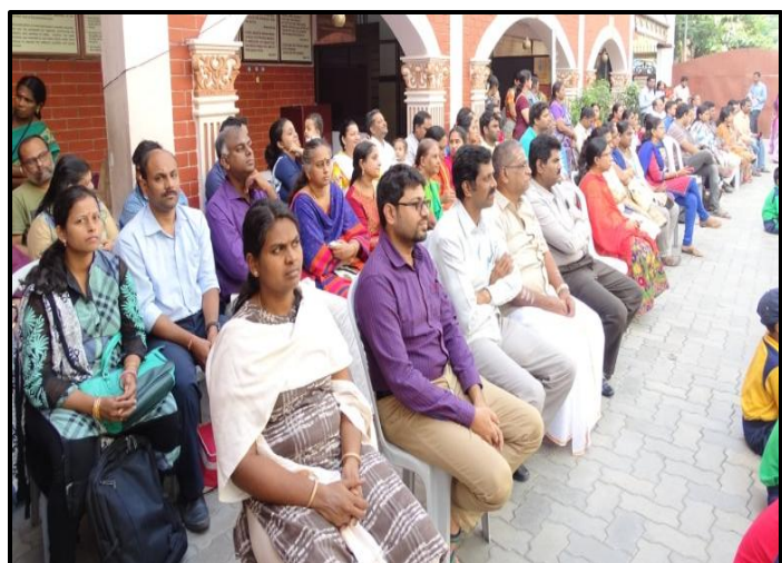
Parents Enjoying the Programme