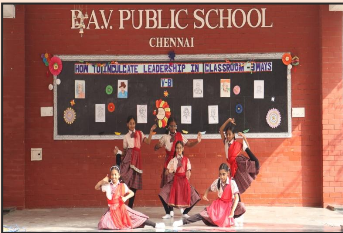
Testament of Collective Effort