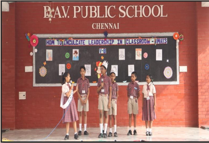
Taking Initiatives in Leadership Roles