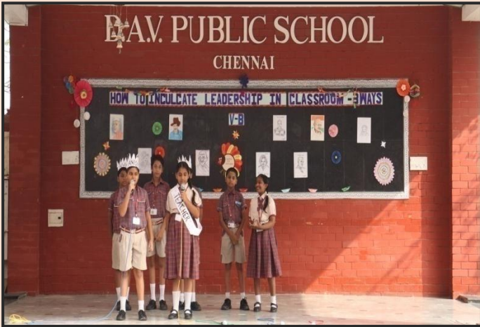
Fostering Growth Mindset