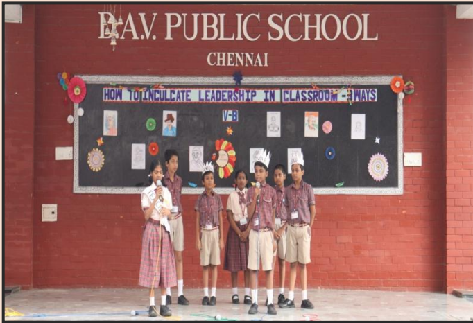
Inculcating Leadership Qualities