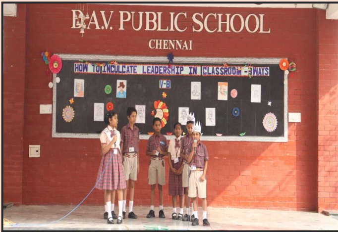
Significance of Collaboration and Teamwork