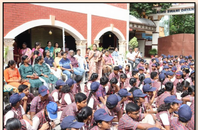
A message of motivation from Parents