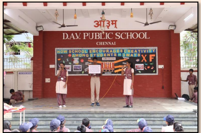
Showcase the creativity in our school