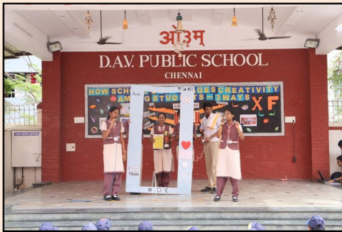
Instant reality of instagram reels to showcase the creativity of DAVite