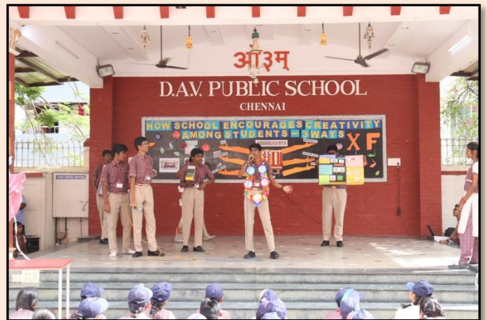
Garland of equations enabling easy memorization