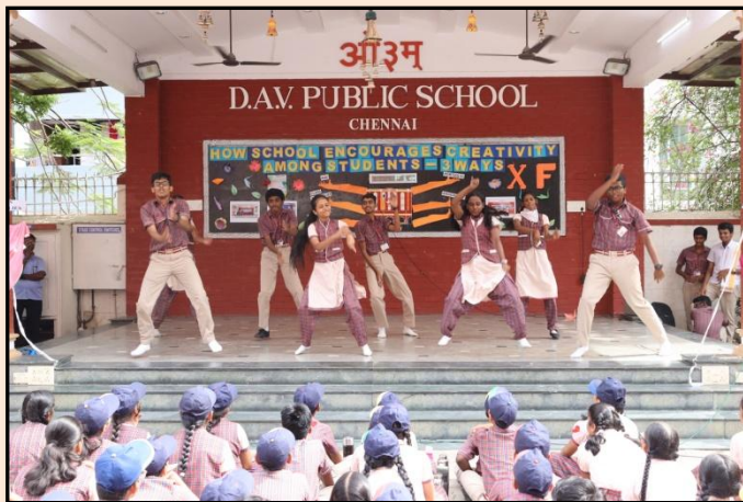
Rhythmic tapping of feet